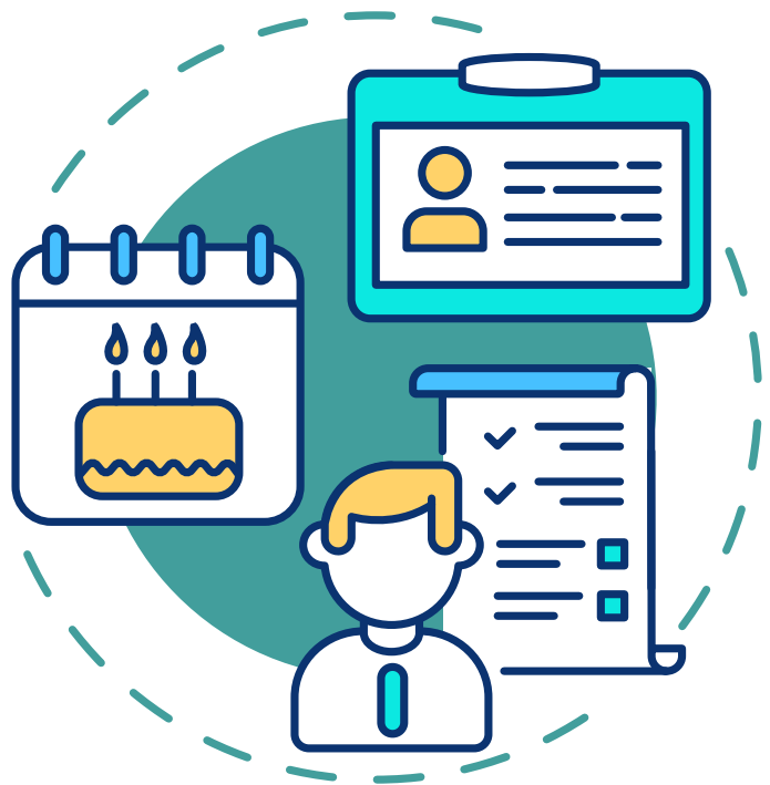
Patient Relevant Information

Uses state-of-the-art public cloud artificial intelligence and machine learning to recognize & extract information from documents, faxes and narrative reports which adds value as more documents gets processed.